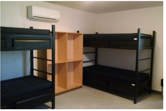
Washington Growers League's Brender Creek farmworker housing in Cashmere, WA.