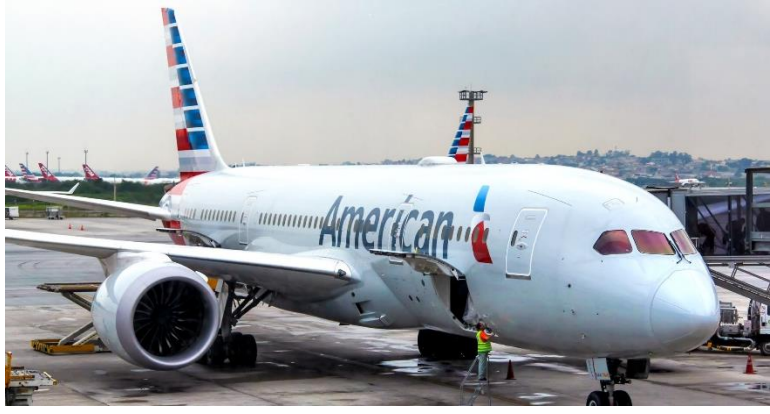
Mexican workers typically travel by bus. Workers from countries other than Mexico must travel by air.