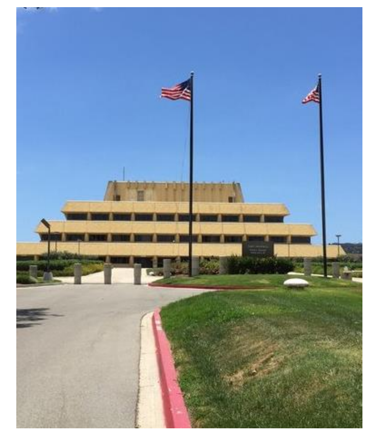
California Service Center in Laguna Niguel, CA.